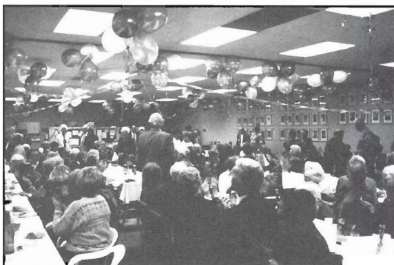
Club room - filled to capacity at dinner