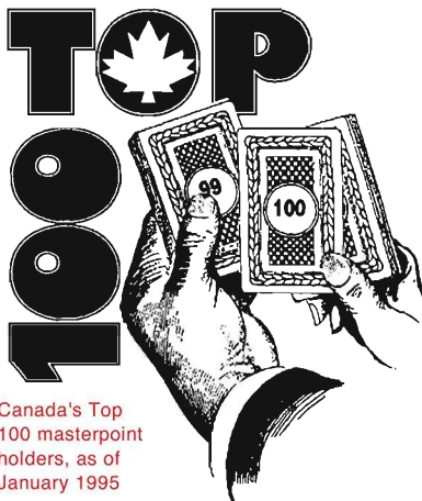
Canada's Top 100 masterpoint holders, as of January 1995