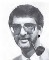
Editor: Allan Simon